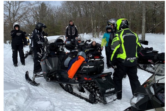
Time for a pit stop

Keep checking in on the website: www.thebeast.ca or The Beautiful Eastern Association of Snowmobile Trails (BEAST) Facebook page for updates. You can also email clubrides@thebeast.ca to be notified of these events. If you have any ideas for a group ride or would like to help out, we would love to hear from you.