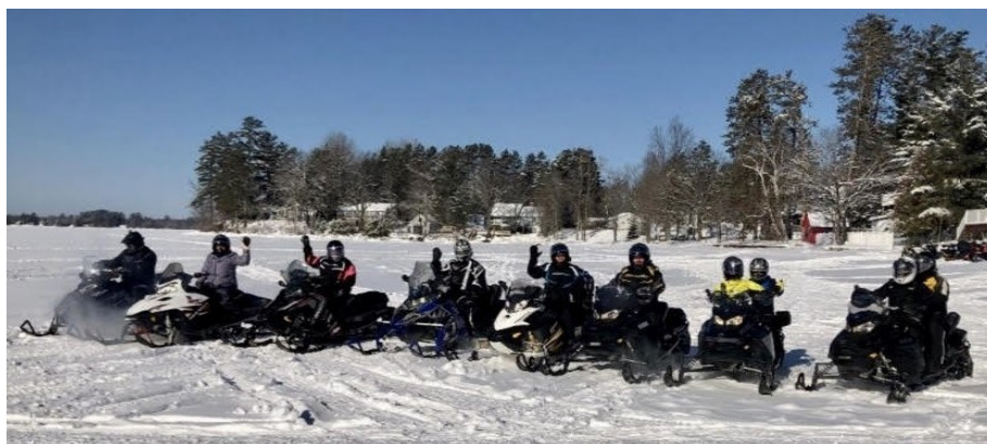
All assembled and ready to head out on the ride

Contact social@thebeast.ca for any questions.