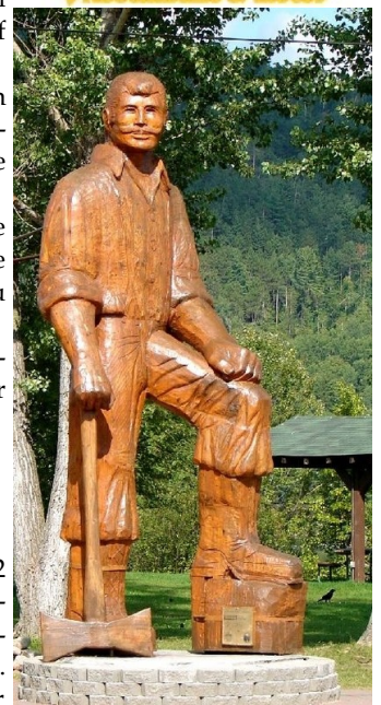
Big Joe Mufferaw paddled into Mattawa, all the way from Ottawa in just one day! Hey-Hey! BRAAP!